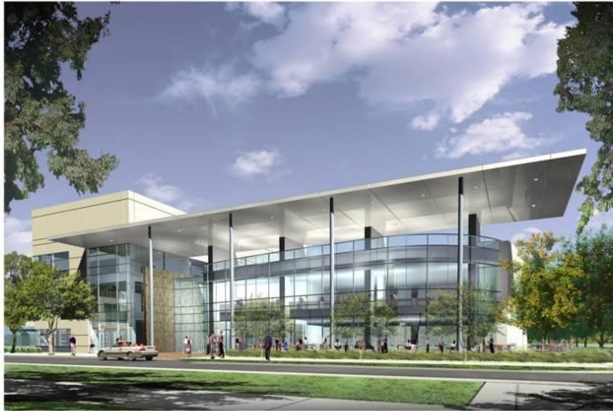
VIEW OF WEST FACADE